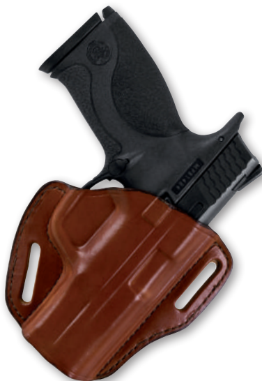
58 // P.I.™