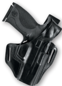
101 // FOLDAWAY™