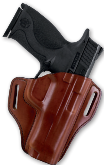
57 // REMEDY™