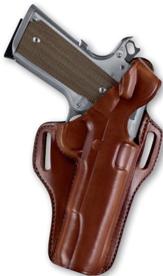
56 // SERPENT™