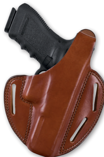
7 // SHADOW® II